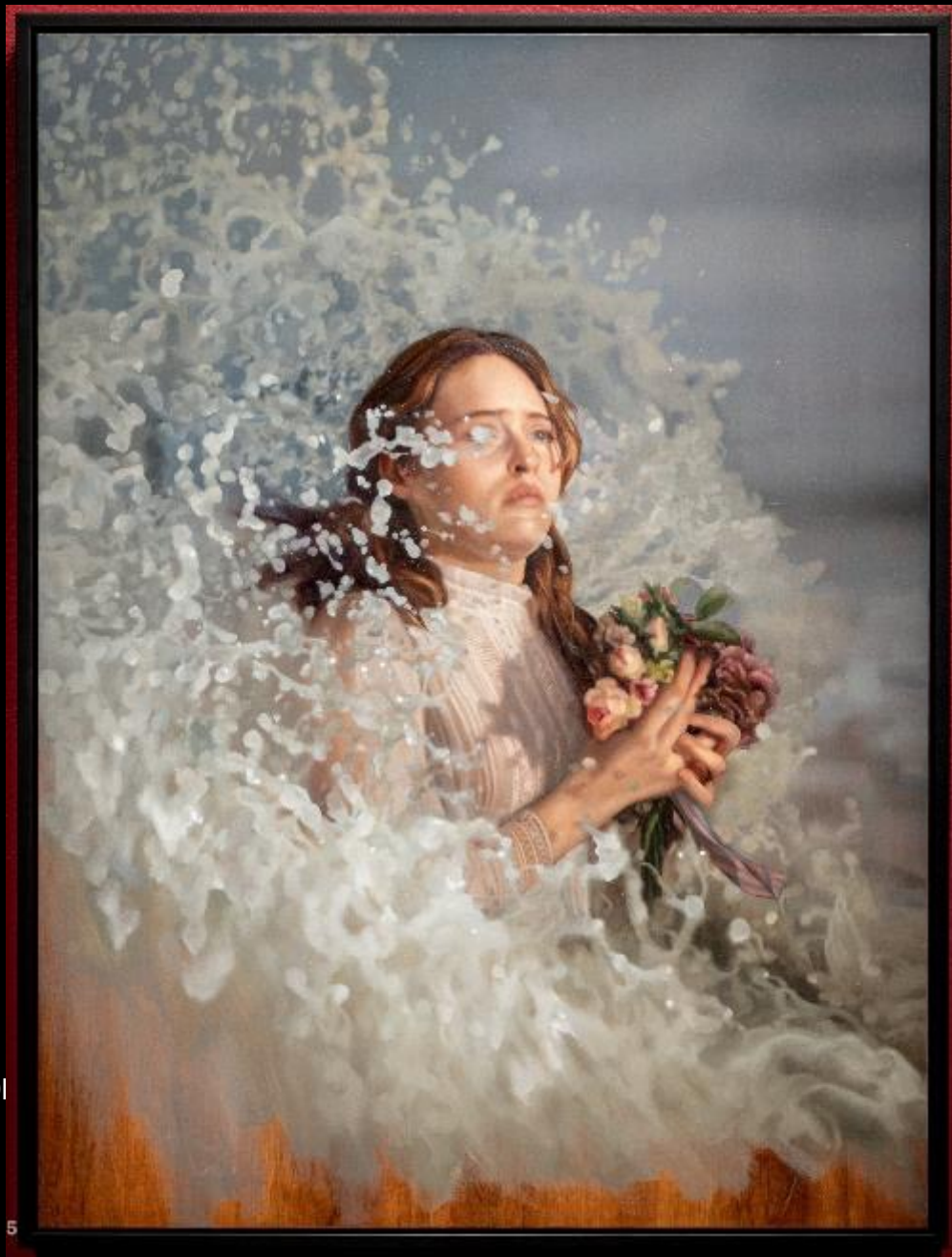
Effie Pryer Baptism, 2023 oil on myrtle panel Commissioned with the support of the TMAG Foundation AG9127