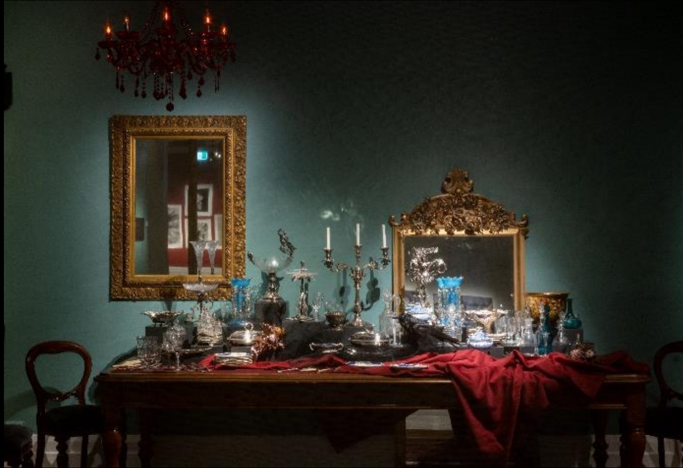
TWIST - Miss Havisham's Breakfast