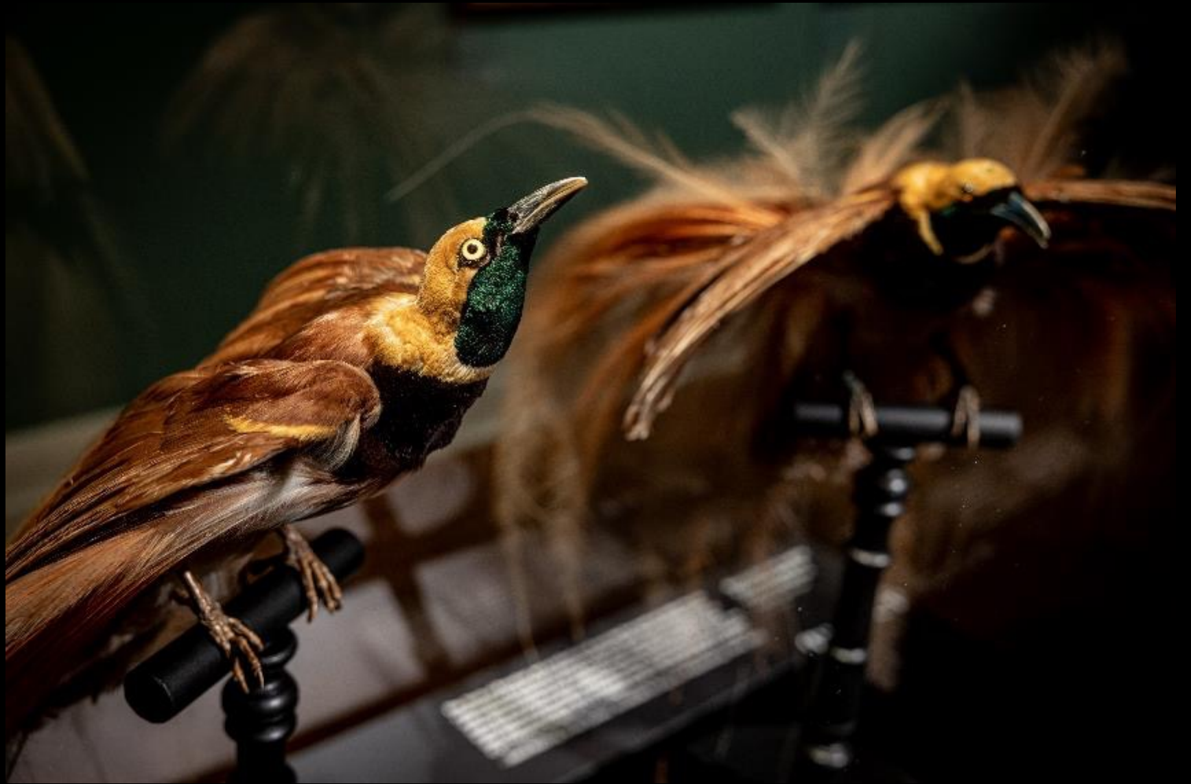
Raggis Bird of Paradise Paradisaea raggiana Papua New Guinea Preparator unknown B3943 and B3944